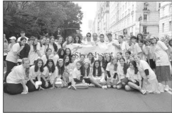
Students from Magen David Yeshiva High School participated in the NYC Race for the Cure.

Sharsheret plays a continuously active role in the community. Earlier, in March 2008, Sharsheret along with the Sephardic Community Center of Brooklyn, New York and the Sephardic Bikur Holim presented a